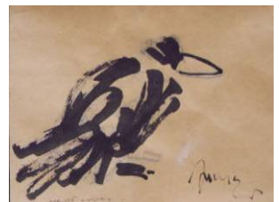
The crow all by himself