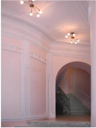
Hotel entrance (first main stairway) after restoration