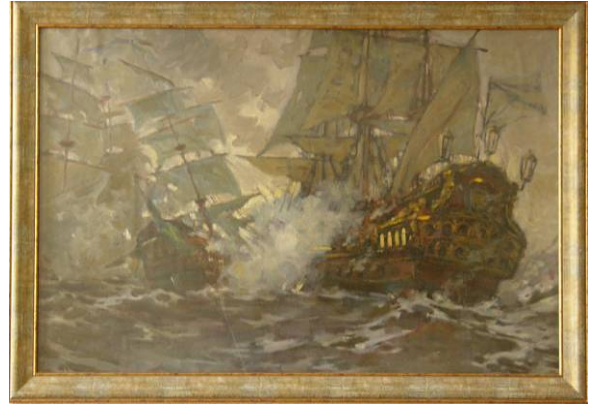
The battle at Gangut