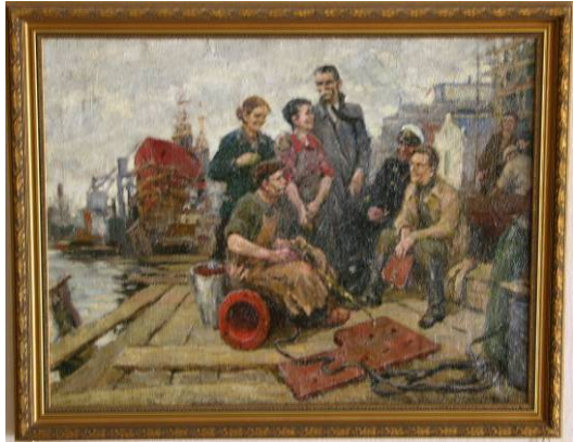
Gorky and Kirov at the Baltic Shipyard