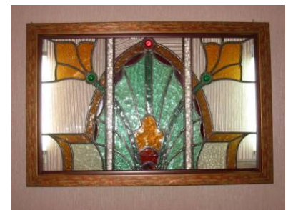
Stained glass inserts from the windows of the first main stairway; after restoration