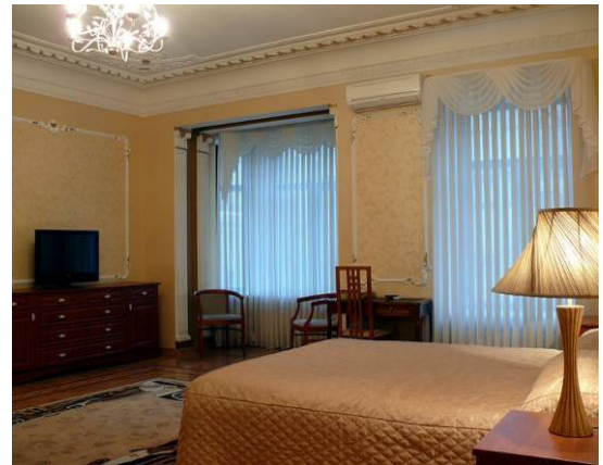
Fully restored room № 411