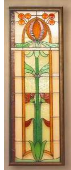
Arch elements of the stained glass window from the second main stairway; before and after restoration