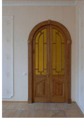
New oak doors made after the damaged or lost doors