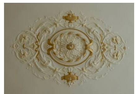
Moulded ceiling décor in room № 410, and in room № 411, study and bedroom, after restoration