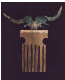
The Great Spaniards