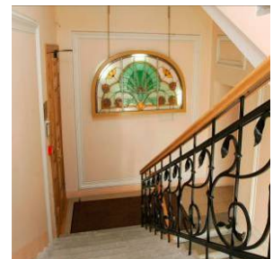
Railings on main stairways: left – second stairway, restoration planned in 2010, center and right – first stairway, after restoration