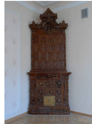
Fireplaces and hardwood floor, № 401 and study of № 411, after restoration