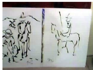
Don Quixote and Sancho Panza